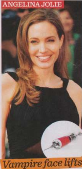
Vampire face lifts

This spooky-sounding cosmetic boost uses real blood to help keep you looking young. Costing around £550 per session, a little of your own blood is extracted, then the skin-plumping plasma containing oxygen-loaded red blood cells is selected and re-injected into your skin to help stimulate the growth of new skin cells.