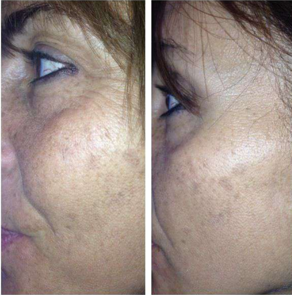
Un-retouched photos taken by a salon owner after using Skinade for 10 days . The reduction in lines around the eyes is noticeable.