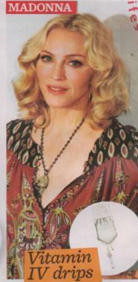
Vitamin IV drips

Originally developed to speed up recovery in cancer patients whose vitamin levels were depleted by chemotherapy, these are now the secret weapon for burnt-out stars. They're given a regular cocktail of vitamins and minerals to replenish energy stores and bring back the glow and gloss to skin and hair. Known as drips spas, expect to pay around £225 for a shot.