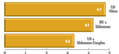
SUNBURN CELL COUNT

Two clinical studies prove that Idebeneone Complex® Superceuticals is effective in improving both moderate to severe photodamage and red and brown pigmented skin. The first study, included 32 women, between the ages of 25 and 65 years, exhibiting moderate to severe photodamage, presented as rough, dry facial skin, pigmentation, fine lines/wrinkles, poor skin tonality, and decreased skin firmness, radiance and brightness. The study subjects used an Idebeneone Complex skincare regimen of Facial Cleanser Even Tones, Eye Serum and Moisturizing Facial Cream twice daily for the 8-week study period; Idebeneone Complex Radical Defense SPF 30 was also included for day use only. The study revealed the following results: