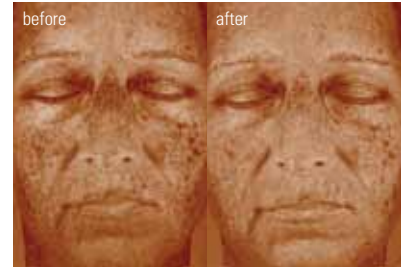
RBX Red shows the vascular disorders; RBX Brown shows the skin tones.

Idebenone Complex is a bioengineered "Co-Enzyme Q10," but up to 1,000 times more effective. It targets aging at the cellular source – the mitochondria – where free radicals produced during cellular metabolism cause cellular damage. Unlike botanical and vitamin antioxidants, Idebenone Complex is a respiratory chain antioxidant; it is the only antioxidant that fights both intrinsic (natural aging) and extrinsic aging (environmental aging).