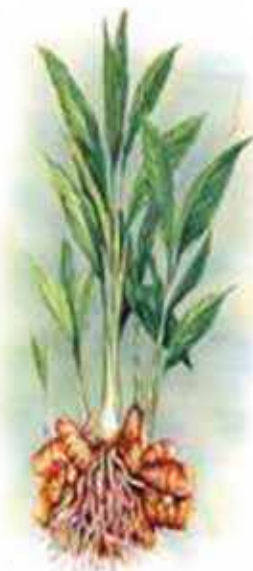
Figure 3. Turmeric rhizome.

Mean mexameter readings of 4 percent HQ cream versus 0.25 percent THC cream treatments were comparable throughout the duration of the study. No adverse reactions were noted with 0.25 percent THC cream. Increasing incidence of adverse reactions to 4 percent HQ cream occurred over time, with 50 percent of the subjects being affected towards the end of four weeks. 0.25 percent THC cream is therefore an effective and safe alternative to 4 percent HQ cream in depigmenting formulations.