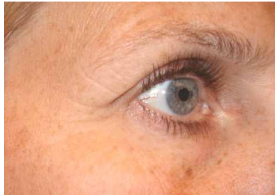
After 30 days