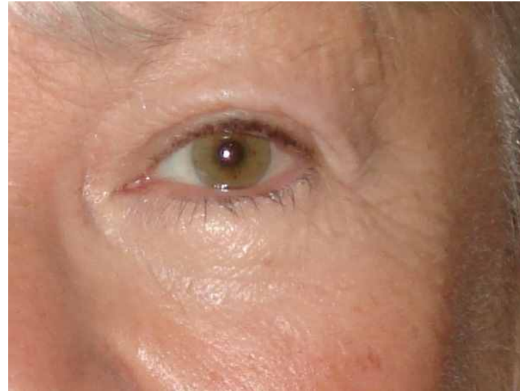
After 30 days