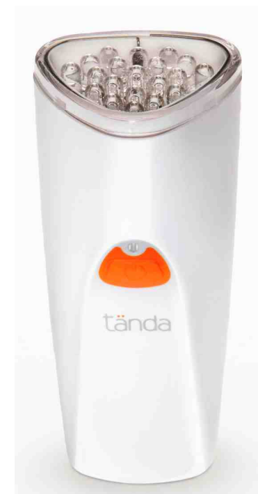
Tända I light therapy device